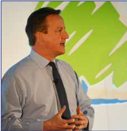
David Cameron taking questions from CCA Members at the CCA Conference 2016.

The policies and general direction of a council are debated and agreed by the elected members. Councillors then play a crucial role in scrutinising those policy decisions once they have been implemented and in monitoring the council's performance.